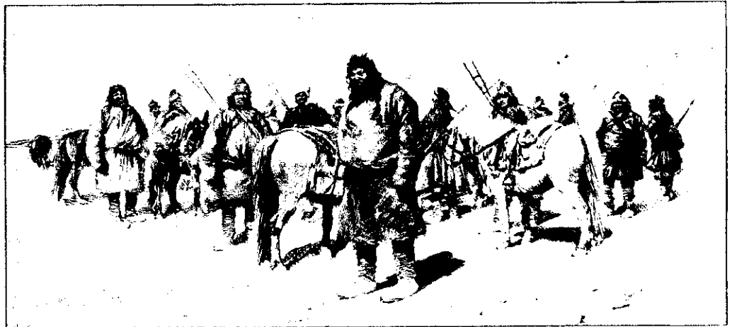
A GROUP OF TIBETAN HORSEMEN DISMOUNTED.