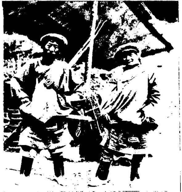
A TIBETAN TRAVELLING MERCHANT AND HIS WIFE.