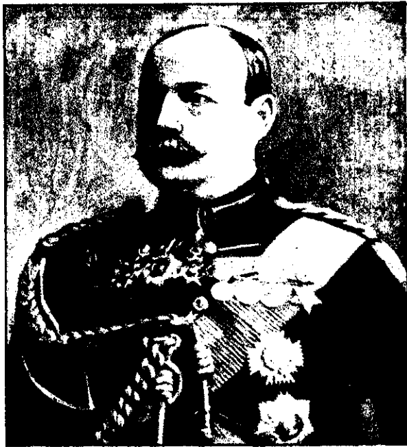
LIEUT-GENERAL LORD GRENFELL, C.C.M.G., G.C.B., Who succeeds the Duke of Connaught as Commander of the Forces in Ireland.