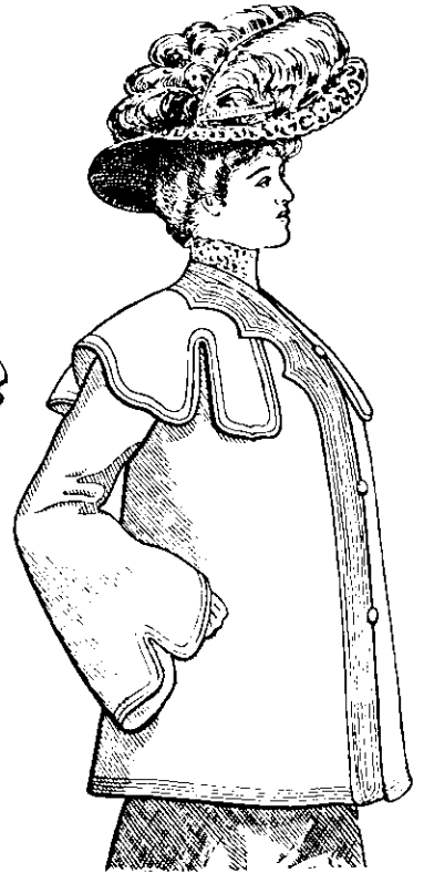
This Style, £3 3s. To Measure, 10s extra. All Sizes, Styles, and Colourings.

TAILOR-MADE Our Own Manufacture. Ready for Immediate Wear. OVERCOATS.