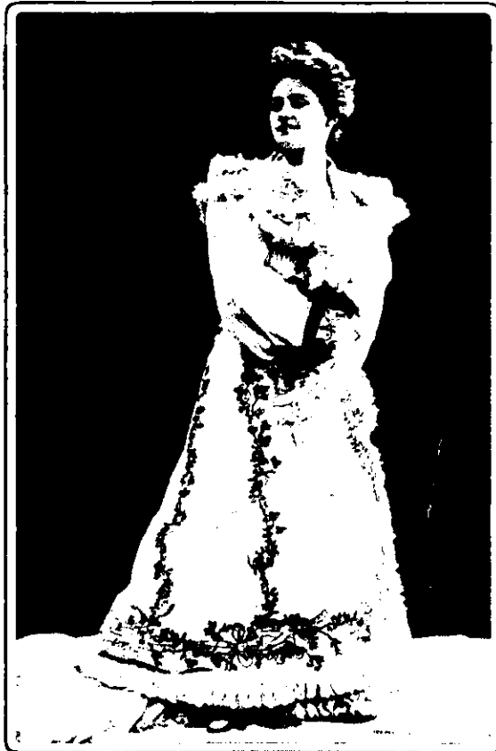
DES TOILETTES PARISIENNES.—A Beautiful Wrap for Evening Wear.

A. WOOLLAMS & CO., LADIES' TAILORS Queen Street, AUCKLAND.