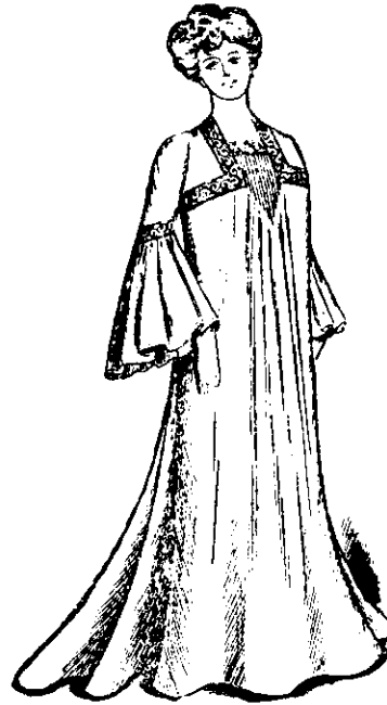
A GRACEFUL WRAPPER.