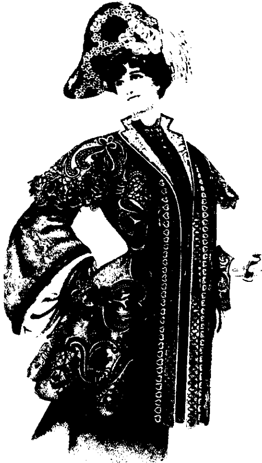
A VERY HANDSOME COAT.