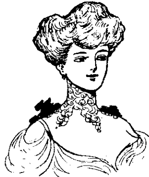
A LACE COLLAR.

There are some pretty collar bands of real lace made with a deep vandyke of lace with the points downwards which will be found useful by anyone with a thin neck, as they are intended for wear with evening toilettes, and are fastened