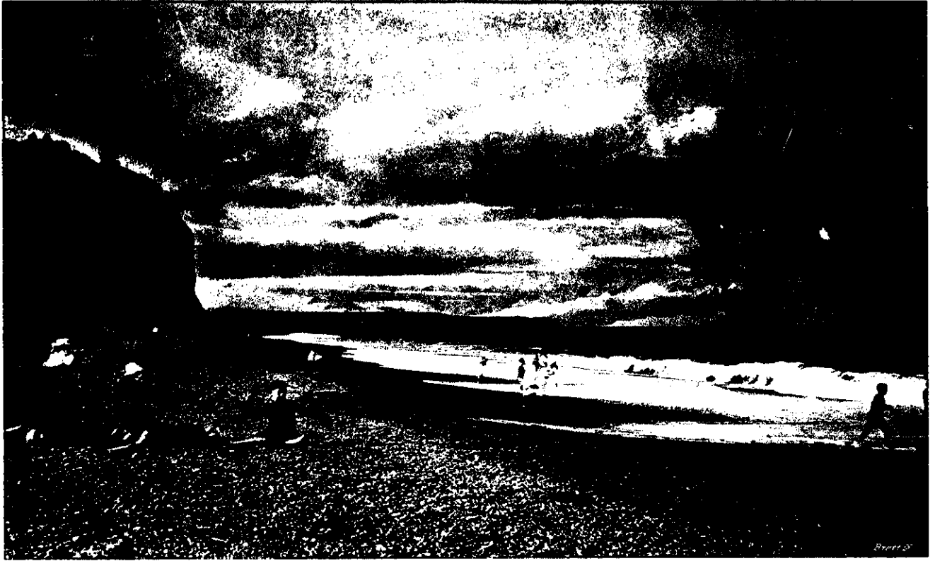
THE BEACH, NAPIER, showing Bull Hill, the Breakwater, some bathers, and steamer leaving the bay.