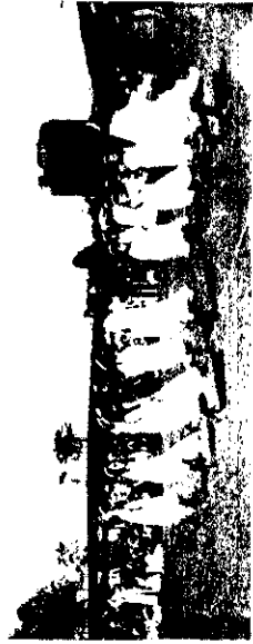
DUMBBELL DRILL BY PUPILS OF THE SACRED HEART SCHOOL.