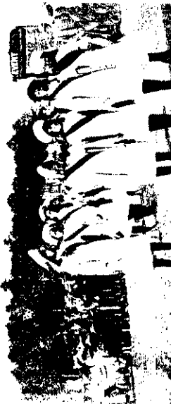
CLUB DRILL BY PUPILS OF ST. JOSEPH'S SCHOOL.