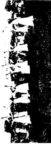
CLUB EXERCISES BY PUPILS OF ST. JOSEPH'S SCHOOL.