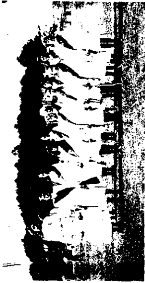
PUPILS OF ST. PATRICK'S SCHOOL, HOBSON STREET.