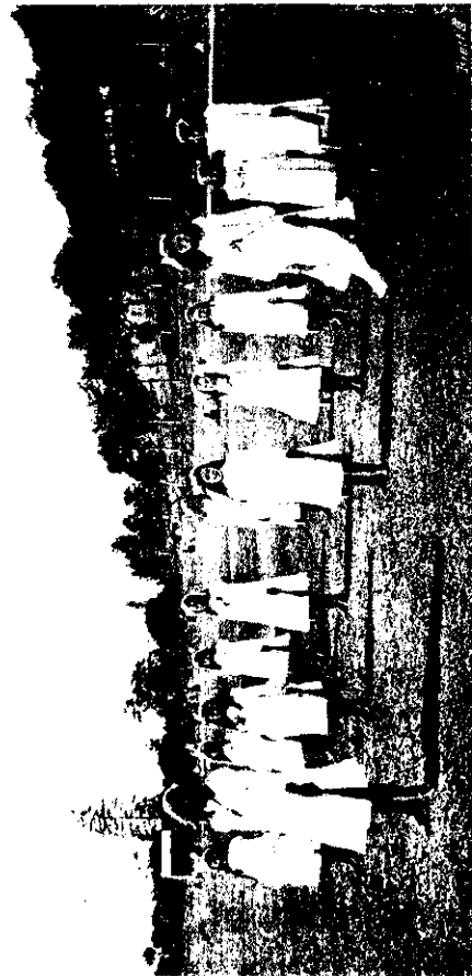
PUPILS OF THE SACRED HEART SCHOOL, WINNERS OF THE COMPETITION.