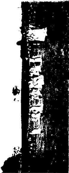
PHYSICAL DRILL BY ST. PATRICK'S SCHOOL.