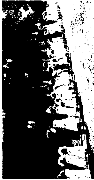
INFANTS IN PROCESSION IN THE DOMAIN.