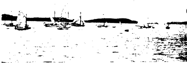
A GLIMPSE OF THE BAY.