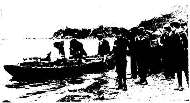
A REFRESHMENT BOAT.