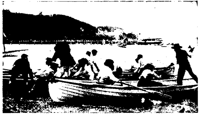
GETTING READY FOR THE LADIES' SCULLING RACE.