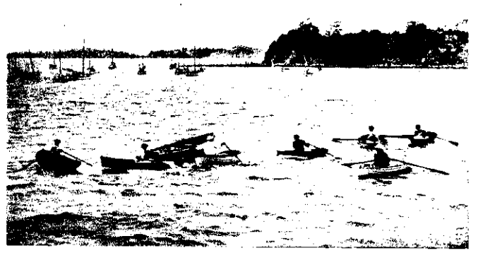
THE DINGY RACE.