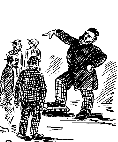
3 Issues departmental instructions to heads of departments.