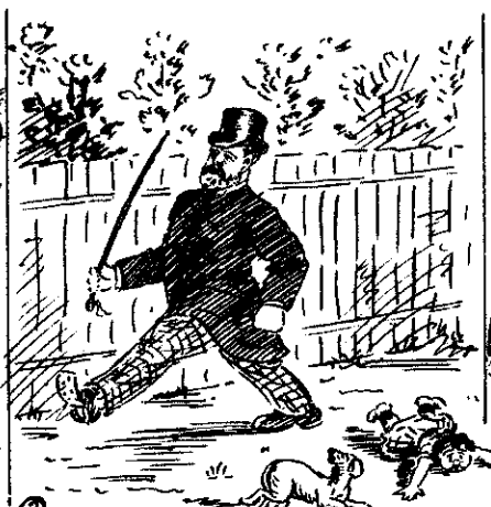
2 Takes a rapid constitutional round Government buildings preparatory to days work