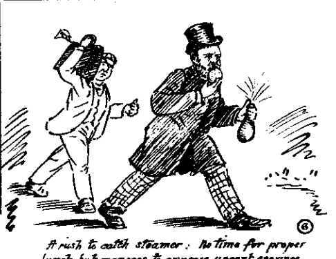
6 A rush to catch steamer: No time for proper lunch but manages to squeeze urgent errands with penny bun and bottle of soda-water (the latter in deference to the Prohibition party.)