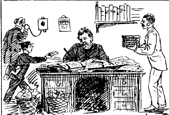
4 Settles fairly down to departmental work