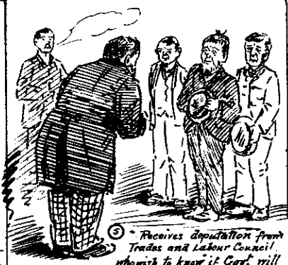
5 Receives deputation from Trades and Labour Council, whomish to know if Govt. will take over all the public-houses and run them on strictly Liberal and Cooperative principles. Explains that he has to catch steamer but will keep the question steadily in view.