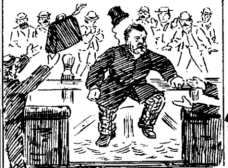
7 Steamer just left wharf; but by a prodigious effort-worth of the man - manages to save his passage. Disappointed Deputation of Unemployed, left on wharf.