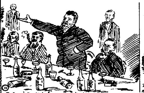
11 Is hurried off to banquet. Makes most brilliant and florid speech lasting two hours Audience somewhat inattentive towards the end