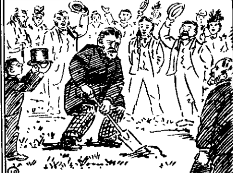
10 Arrives at Nelson just in time to turn first sod of 'The Liberal Cemetery'. Proceeds somewhat tame owing to absence of any conservative Corpse!