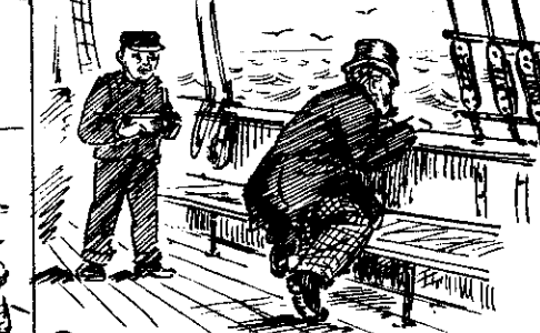
9 More departmental work. (urgent)