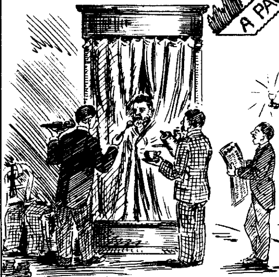
1 Arises at break of dawn. Takes cold shower bath, and, with the view of saving precious moments, also takes breakfast and listens to the morning news being read at same time.