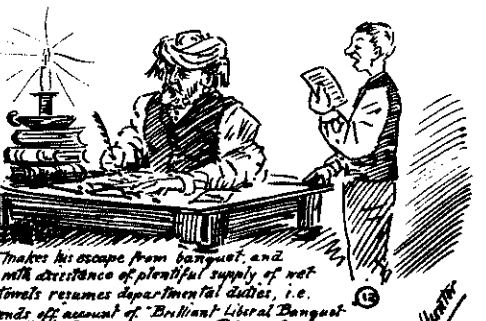
12 Makes his escape from banquet, and with assistance of plentiful supply of net towels resumes departmental duties, i.e. sends off account of 'Brilliant Liberal Banquet' to all leading newspapers. Retires at 3.50 am

The above is suggested by a recent article in a Southern Contemporary