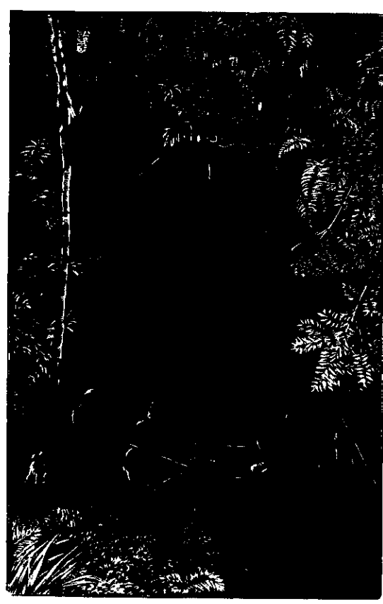
ENTRANCE TO MACE'S CAVERN.