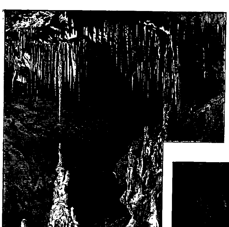
THE STAVES AT