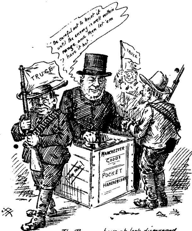
The Boobers have at last discovered a use - unfortunately not the orthodox one, - for the harmless and necessary pocket handkerchief.