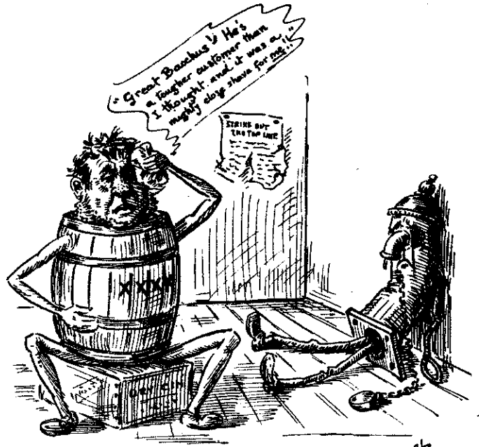
YANQUISHED! (FOR THE TIME BEING.)