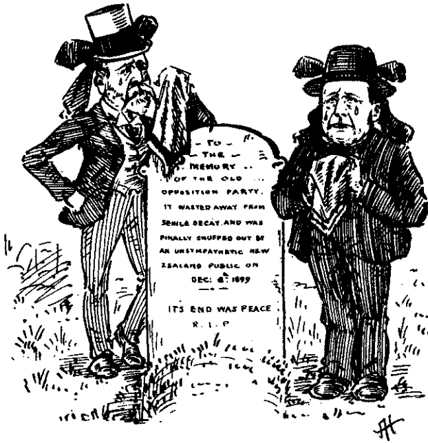
DECEMBER 6 th 1899