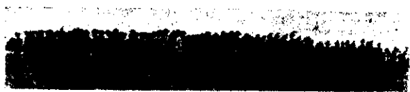
THE NO. 1 BATTALION.