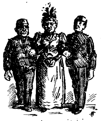
"ur perhaps a pillar of society beingmarshed off to the cells,"

her majesty. Really if the Govern-ment wish to help the shop assistants they should amend the act so as to provide for the foreible arrest of these inconsiderate shoppers, either on the ground that they are obtaining services under false pretences or are mentally incapable of doing their own shopping. If the inspectors will only keep track of the worst offenders they will be ready when the proposed amendment is introduced into the Act