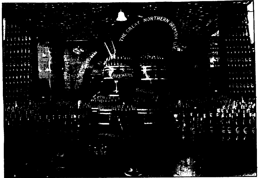
SECCOMBE & SONS' GREAT NORTHERN BREWERY EXHIBIT.

One of the features of the Exhibition from an artistic point of view is the representation of a pretty beer garden kiosk by the Great Northern Brewery Company, of Kyber Pass. This exhibit bears individuality in design, and it altogether breaks away from the carpenter and joiner effects of many stalls. The ceiling of the kiosk is composed of a representation of trellis work with hops intertwined and at the back-ground is a well-executed painting on canvas showing the cellars of the grand old Kyber Pass brewery. In the centre of the kiosk is a pyramid of casks, which bear the time-honoured name of Seccombe. The roof of the kiosk is supported by four columns of casks. Inside the pyramid is displayed in an artistic way the various wares of the firm and samples of their products, besides samples of New Zealand barley and hops, flake rice, patent malt for stout, and malt used in the brewery. The whole is