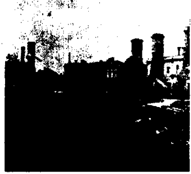
VICTORIA STREET, HAMILTON. WESTERN SIDE.