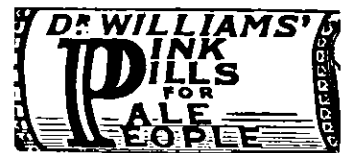
FAC-SIMILE OF ONLY GENUINE PACKAGE.

Dr. Williams' Pink Pills for Pale People are sold by Chemists and Storekeepers generally; or the Dr. Williams' Medicine Co., Wellington, N.Z., will forward, on receipt of stamps or post order, one box for 3s, or half a dozen for 16s 6d.