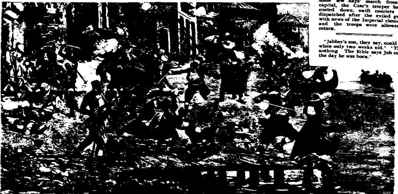
THE TURKISH OUTRAGES IN TRBIZOND, WHERE OVER SEVEN HUNDRED ARMENIANS WERE MASSACRED.