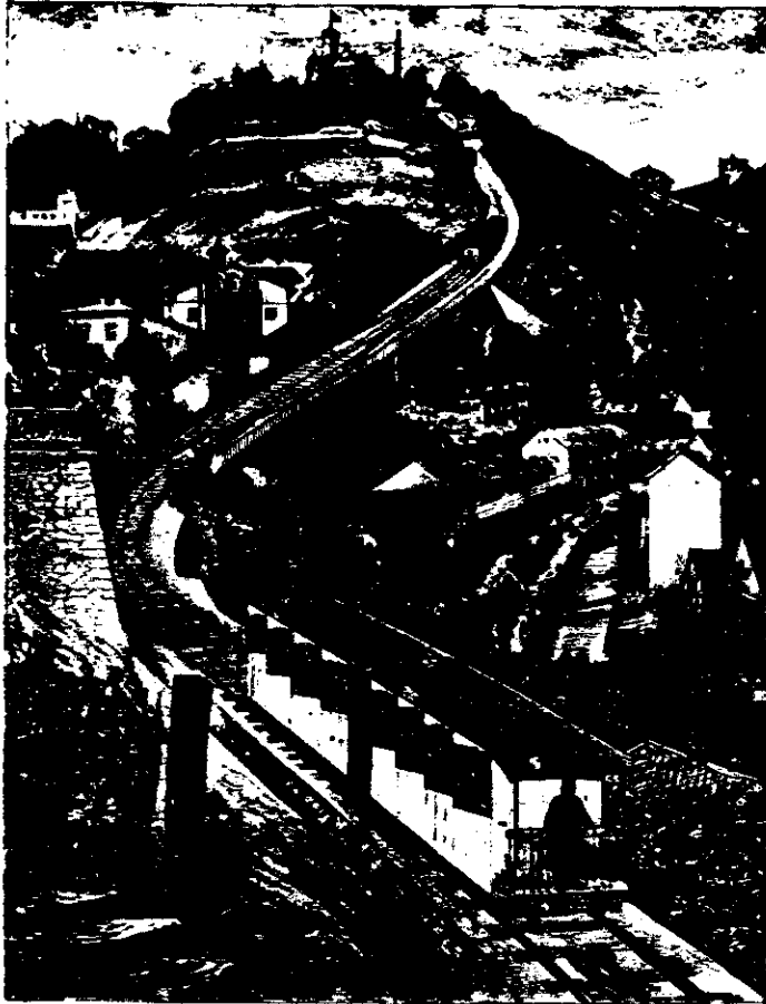
THE CABLE-ROAD BETWEEN LOSCHWITZ AND WEISZER HIRSH MOUNTAINS, GERMANY— SEEN FROM BURGBERG, IN LOSCHWITZ, GERMANY.

The simple construction would seem to be well suited for pleasure railways and light passenger traffic, and the success of these lines would undoubtedly lead to the construction of express lines between the great business centres of the world.