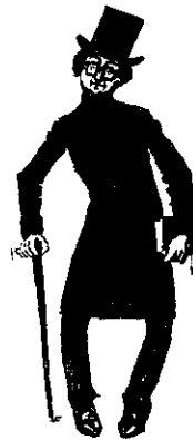
This man is perfectly straight.