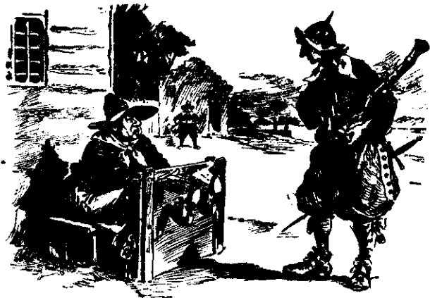
THE ORIGIN OF THE PHRASE.

Mrs. WHEEDICK.—I hear that your house was ransacked by burglars last night; of course they got all your jewels? Mrs. SHREWASBURY-SHARPE.—Nothing of the kind! My jewels are perfectly safe; you see, I keep them in a folding-bed; and, as the burglars were only in the house an hour, they had a time to open it.