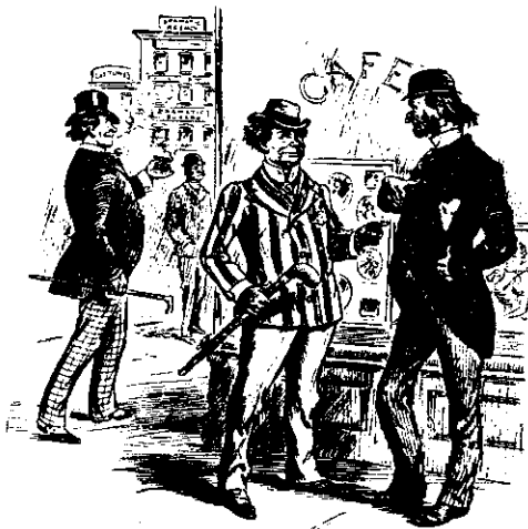
FOUND HIS FIELD AT LAST.

GUARD.—Do you think your sentence too severe? PRISONER.—Oh! I can't kick.