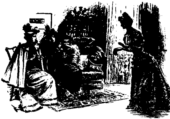
DID NT KNOW THE COMBINATION.

Mrs. WHEEDICK.—I hear that your house was ransacked by burglars last night; of course they got all your jewels? Mrs. SHREWASBURY-SHARPE.—Nothing of the kind! My jewels are perfectly safe; you see, I keep them in a folding-bed; and, as the burglars were only in the house an hour, they had a time to open it.