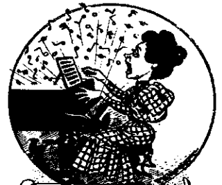
(A Pound Party.)

"Dot vos a bad cough you haf, Isaac?" "Yab; I soldt a couple pairs of those shoe-drings from arount my neck, and der cold vas settled in my chest!"