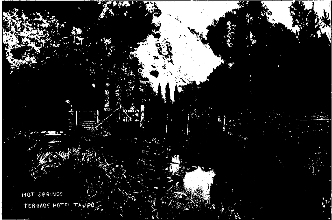
HOT SPRINGS TERRACE HOTEL TAUPO