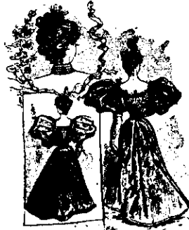
SOIREE DRESSES AND COIFFURE.

For my second, third, and fourth illustrations, I give some evening styles new and pretty. 2. Five bouillons Reccamier adorn the brow, whilst the sides are carelessly undulated. From the high chignon escape tiny curls, real or false; in the centre is fastened an cigarette of gilt wheat.