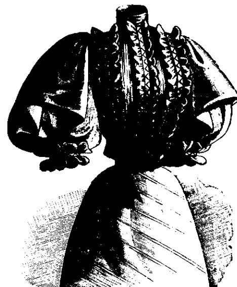
NEW FRENCH BLOUSE.

The sixth sketch shows a new French blouse made in nymph pink crepon or canvas cloth, accordion pleated, and