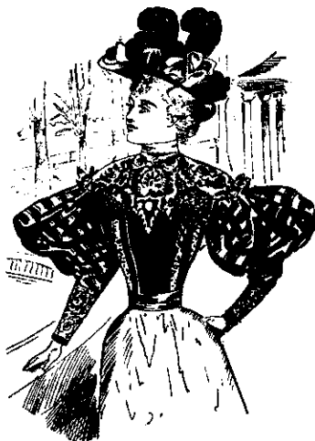
A NEW BLOUSE CORSAGE.

The days of the dressy blouse are not yet numbered, and will be the vogue for many a month to come. With black satin or motté skirts the Parisiennes are extremely partial to white satin corsages covered with light-coloured chiffon gathered à la Bébé . For instance, mandarine yellow silk muslin smothering a creamy foundation is very popular with brunettes, while orchid mauve chiffon veiling white has a decided run among blonde young ladies. For day purposes the magpie blend is one of the smartest. Black and white is always safe and ever undeniably elegant. The blouse following my hat is made with the new Empire sleeves gathered to the yoke at some inches below the shoulder line. These important affairs are built in a soft black and white check surah, and from the elbow are provided with a slender cuff of black jet and narrow silver