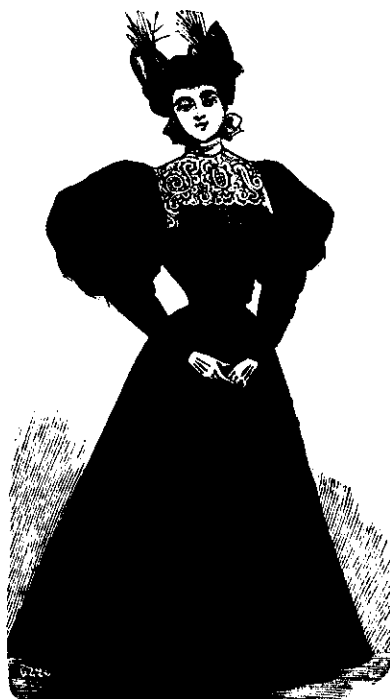
PARIS AFTERNOON COSTUME.

The fifth illustration is a fashionable Paris walking dress. It has a round bodice with gigot sleeves and godet skirt in