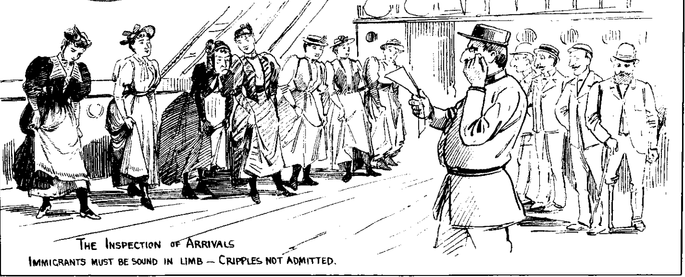
THE INSPECTION OF ARRIVALS IMMIGRANTS MUST BE SOUND IN LIMB - CRIPPLES NOT ADMITTED.