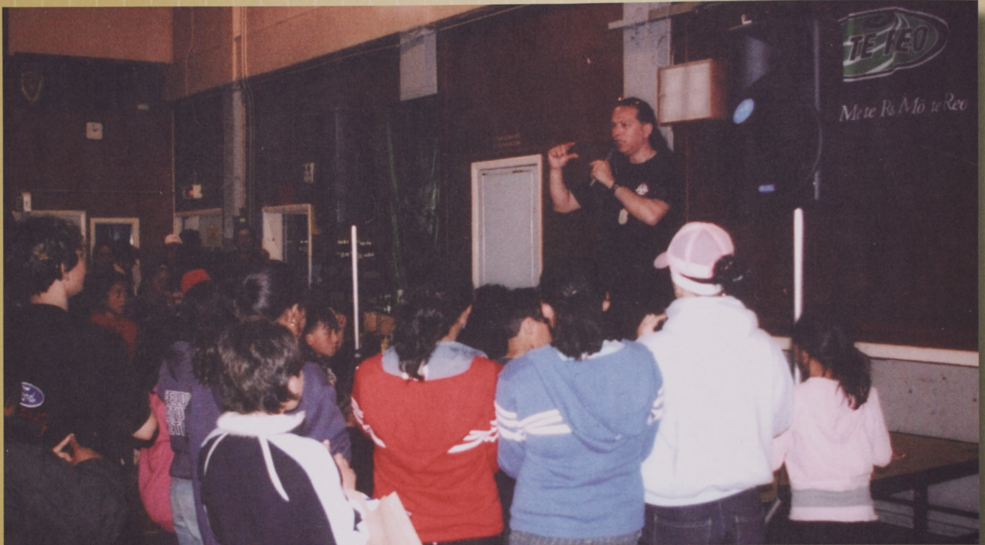
Kōrero Māori mai, waiata Māori mai i ngā wā me ngā wāhi katoa.

He pūkenga wai he kawenga rākau, he pūkenga tāngata he kawenga kaupapa.