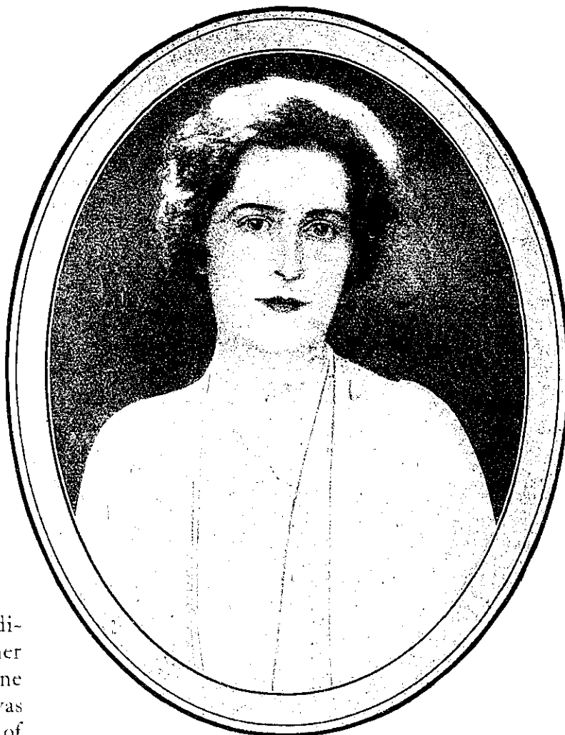
In her New York home the beautiful young Duchesse presides over the famous collection of antiques which has come down to her husband from the great Cardinal, first Duc de Richelieu

tells how to keep the skin exquisitely soft and lovely