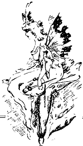
The Magic Brush

Head Office and Main Showroom: WYNDHAM ST., CITY Branches: PITT STREET (near Karangahape Road), ONE-HUNGA, DEVONPORT, TAKAPUNA, ST. HELIERS, OTAHUHU