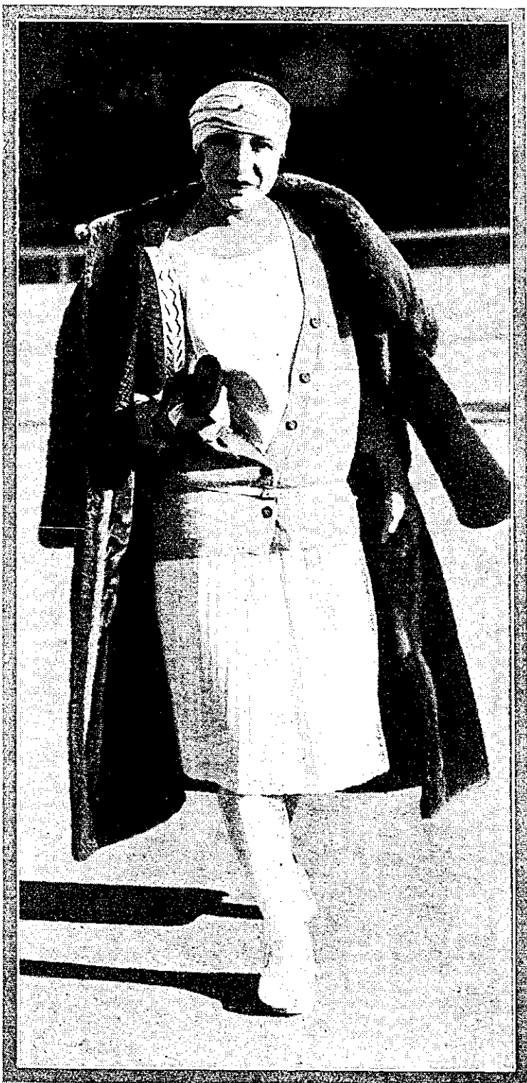
Mlle. Lenglen, the world's Champion Lawn Tennis Player, on the Riviera.