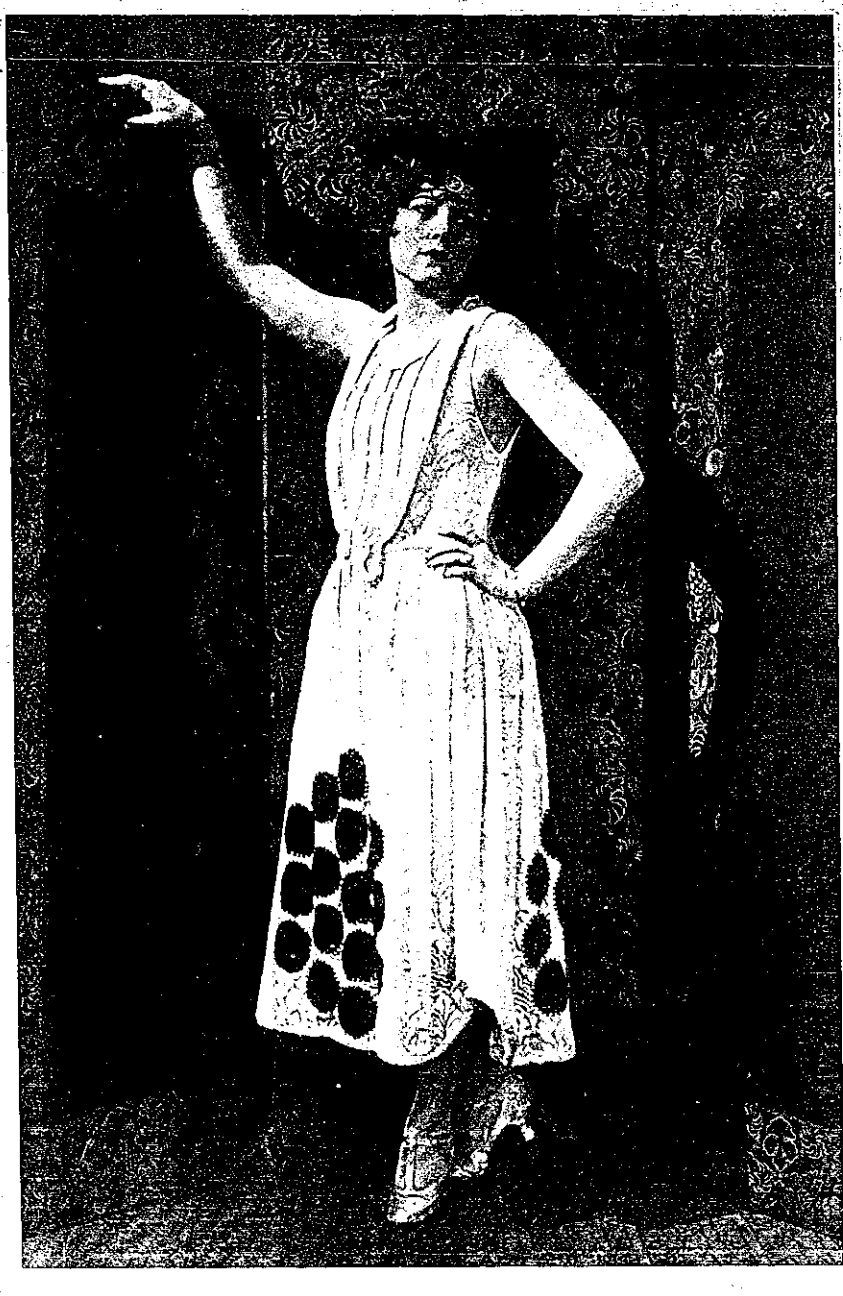
This striking evening goven of white velvet broché trimmed with pearls was designed for Miss Allene Ray, the screen star.

"the north (or, at any rate, the chill), wind doth blow," and its biting blasts are sending you shivering to warm firesides indoors and cosy wraps out. Never mind, Chère, Paris is still planning for your comfortable elegance, and you need fear neither the weather nor your own appearance.