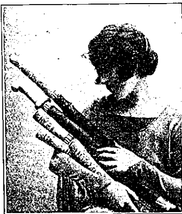
As the finishing touch to an attractive autumn costume, the latest novelty in umbrellas provides the right note.

Here we are just entering upon the autumn season with plenty to interest us in the world of Fashion. Last month I gave you some idea of