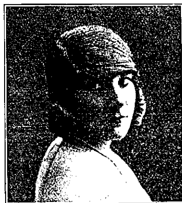
Golden tresses are popular with the Parisienne. Attractive wigs of gold or silver thread are worn in the evening over bobbed hair.

elegance in the line is maintained by the high collar of the jacquette. For ease and grace of movement, the skirt is either pleated or split at the side, and in most cases this