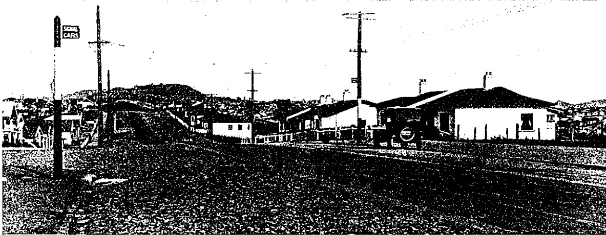
Road Progress in Auckland: Old Mill Road, showing development of City Council's new Housing Scheme.