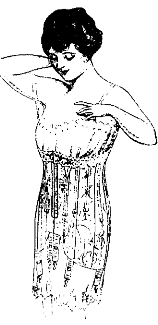
847 Bon Ton Back Lace for full figures, low bust, long skirt, with cutaway front. Reduces hips and thighs. Substantially boned. Made in pink broche 45/-