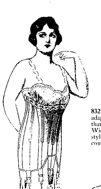
832 Bon Ton Back Lace, ideally adapted to meet the requirement of that type of figure which is average. Wide elastic sections in bust, support, style and comfort. Made in flesh pink contil. 29/6