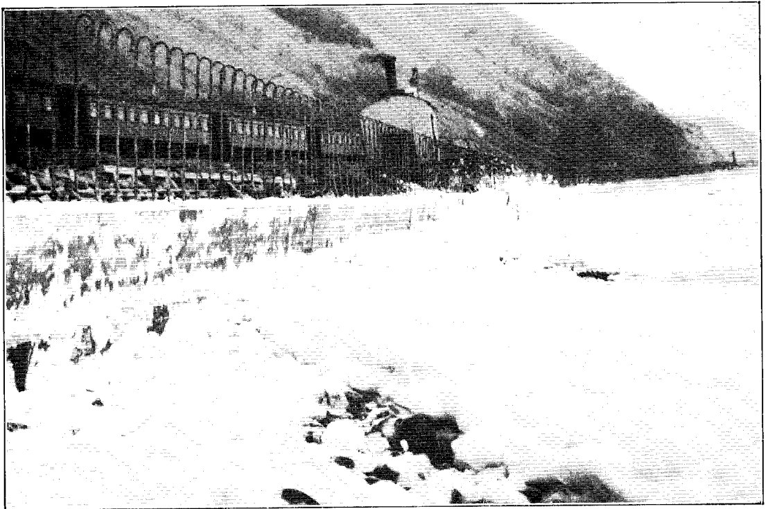
PARTLY-CONSTRUCTED SEA-WALL: STORM OF 14TH JANUARY, 1939.