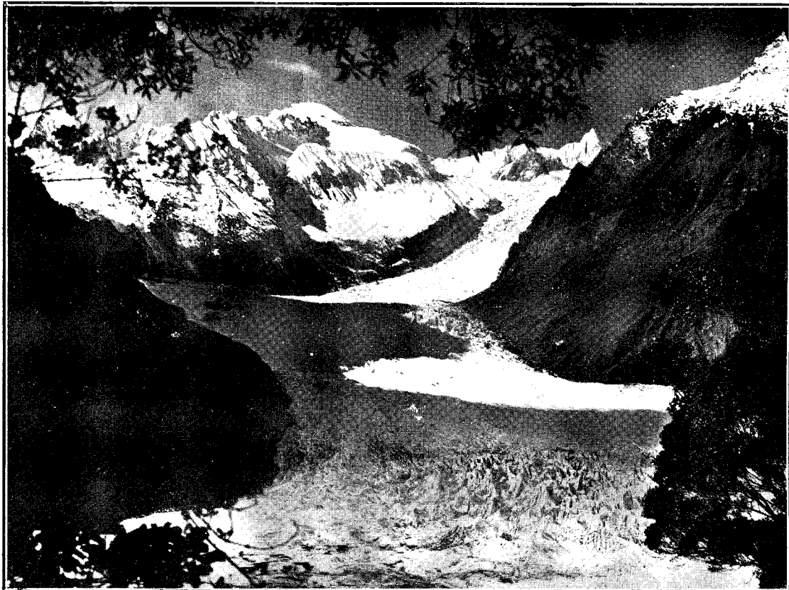
FIG. 9.—View looking up the Fox Glacier from the summit of Cone Rock. In centre the ice-capped Chancellor Ridge, at the base of which is the new alpine hut and in the background the sharp summit is that of Douglas Peak.