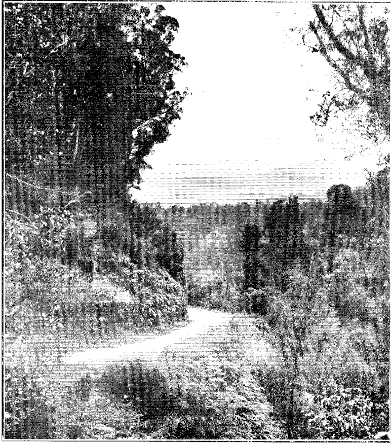
MT. HERCULES, MAIN SOUTH ROAD TO FRANZ JOSEF GLACIER.