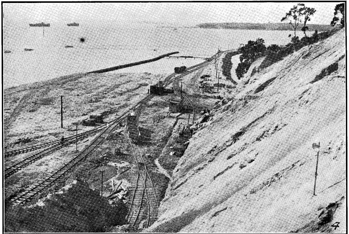
CUTTING AND EMBANKMENT AT CAMPBELL'S POINT. Orakei waterfront road on left.