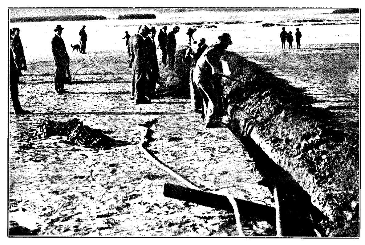
PREPARING TRENCH FOR SHORE END OF CABLE AT LYALL BAY.