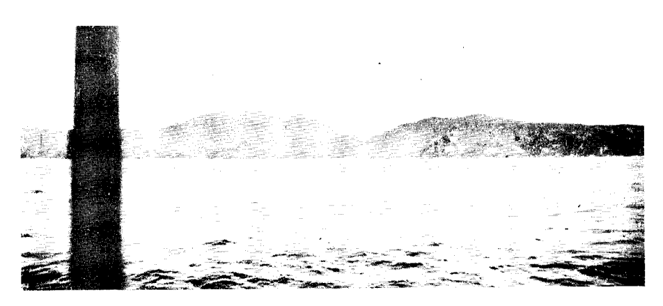
THE GREAT KING, SHOWING THE SUMPH EXYLLOPED IN FOR-