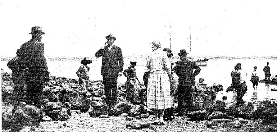
ROCK-OYSTER CULTIVATION, BAY OF ISLANDS.