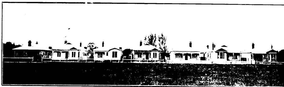
CHANCELLOR STREET SETTLEMENT, CHRISTCHURCH.

6 dwellings; 4 and 5 rooms. Rents range from 13s. 6d. to 14s. 9d. per week.