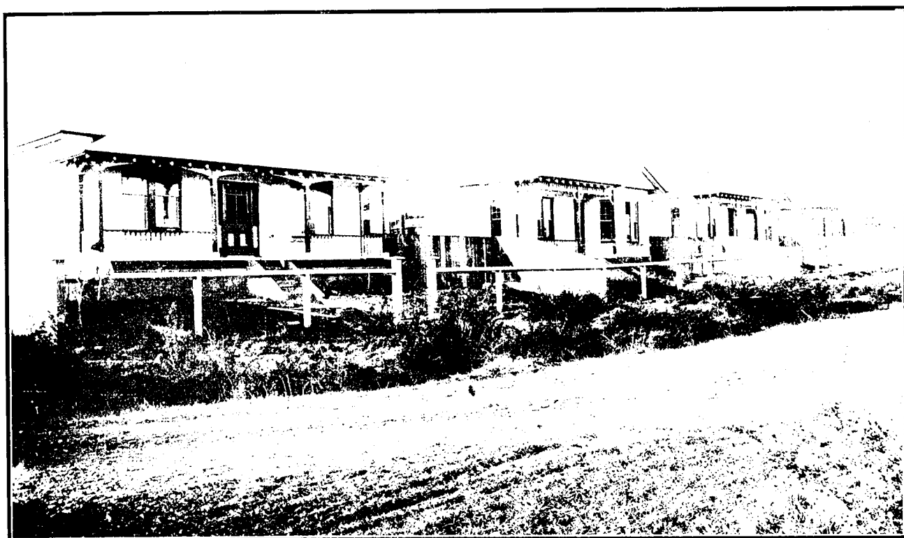
MILTON STREET SETTLEMENT, TIVARD.

7 dwellings: 4 and 5 rooms. Rents range from £2s. 2d. to £3s. 9d. per week.