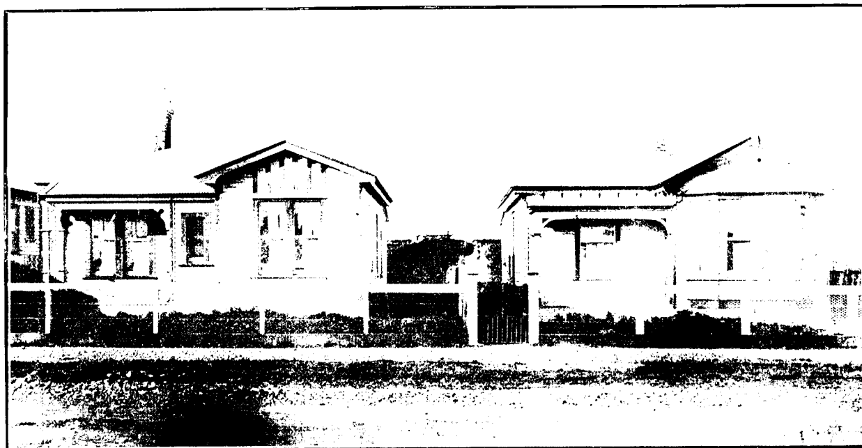
WALKER SETTLEMENT, CHRISTCHURCH.

(The rents mentioned include fire insurance, but not rates.)