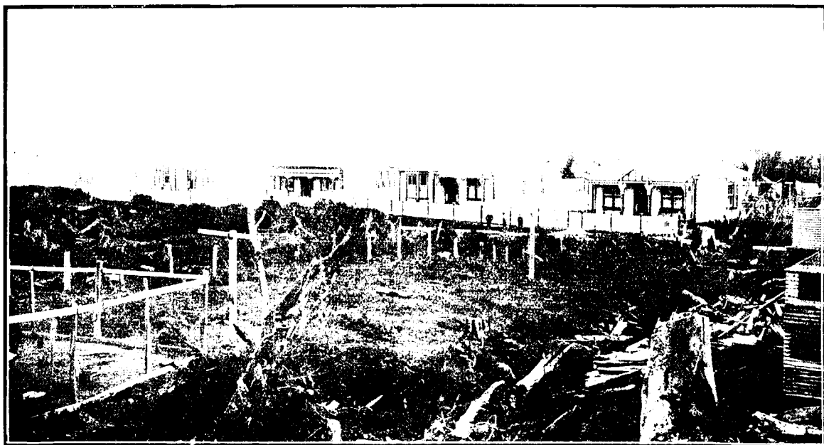
CORBEN SETTLEMENT, GREYMOUTH.

(The rents mentioned include fire insurance, but not rates.)