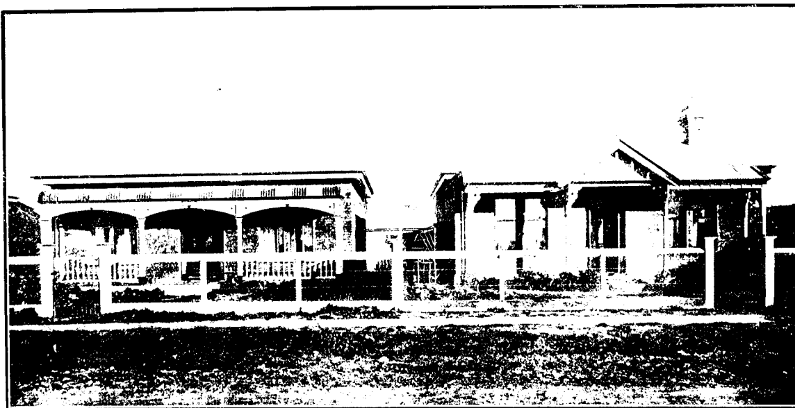
SEWARD BUSH SETTLEMENT, EXMOUTH.

12 dwellings; 4 and 5 rooms. Rents range from 10s. 8d. to 13s. 10d. per week.