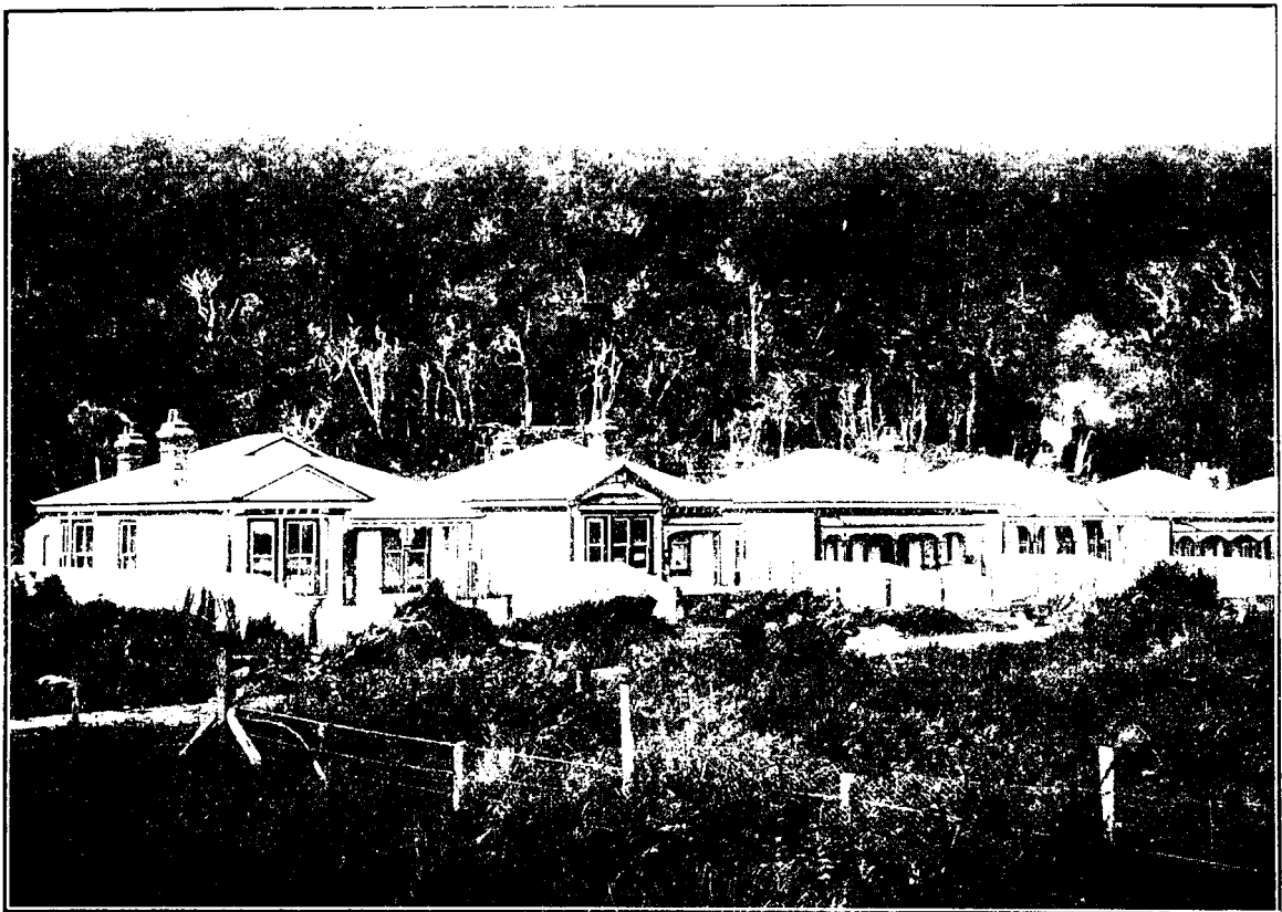
CORBEN SETTLEMENT, GREYMOUTH.

12 dwellings: 4 and 5 rooms. Rents range from 10s. 8d. to 13s. 10d. per week.