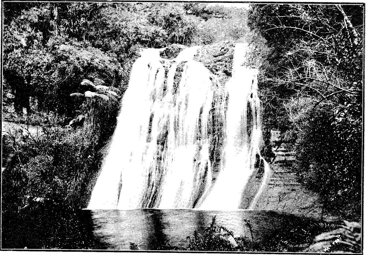
LOWER FALL, WAITAKERE, AUCKLAND.