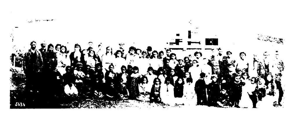
\mathbf{W}_{\mathrm{APET}L} Native School. Royon a.