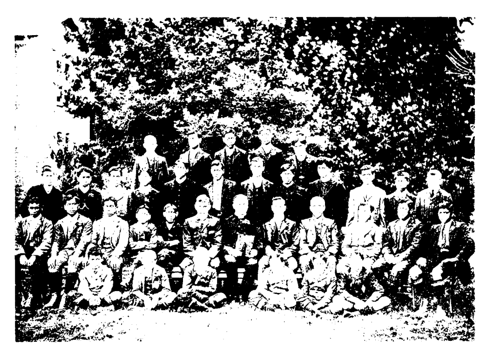
. High are the \hat{\theta}_{\rm c} and \hat{\theta}_{\rm c} and \hat{\theta}_{\rm c} are the HSO