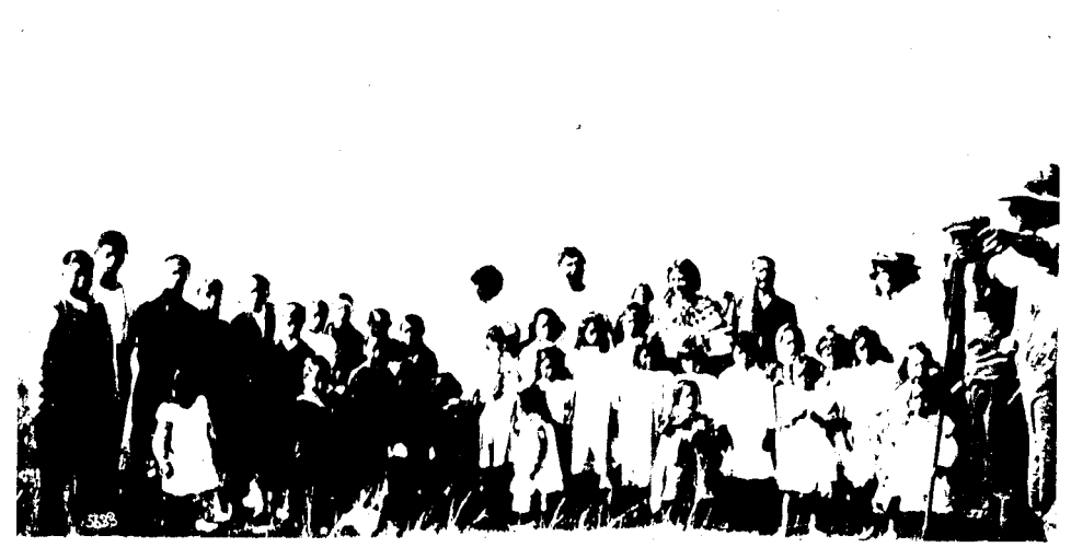
APPLICANTS FOR A NEW SCHOOL.