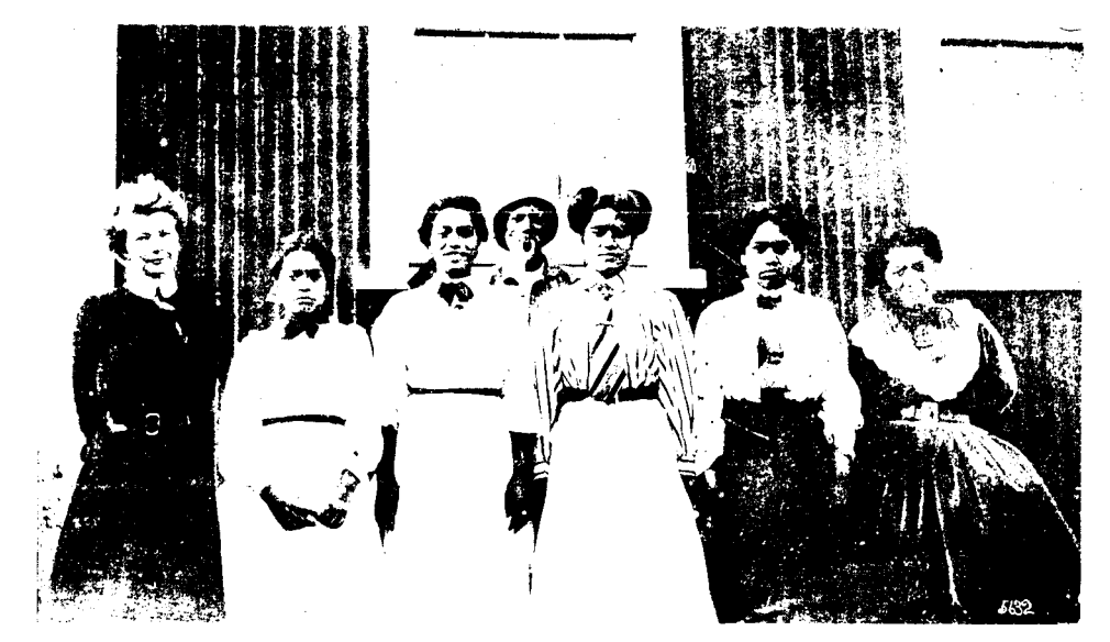
SENIOR GIRLS OF MOTHER ISLAND SCHOOL.