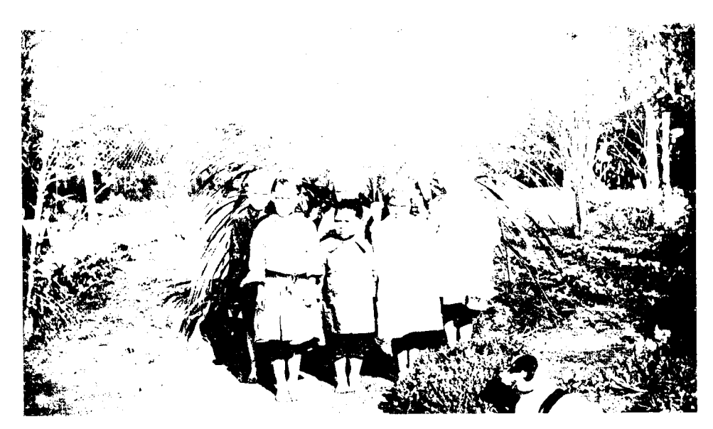
INFANT CHILDREN (MAORE AND ELROPEAN), PARROA NATIVE SCHOOL