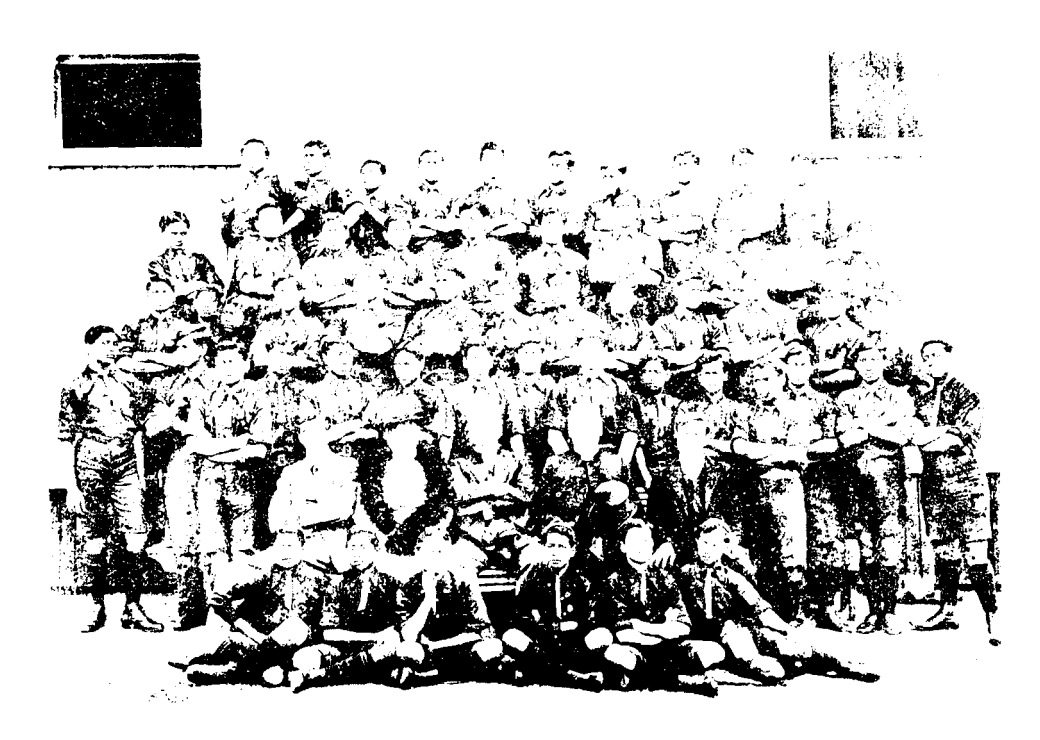
\mathbf{S} = \mathbf{S} \exp \left( \mathbf{x} \times \mathbf{s} \right) \mathbf{S} \exp \left( \mathbf{q} \right) \mathbf{A} \exp \left( \mathbf{q} \right) \exp \left( 1910 \right)