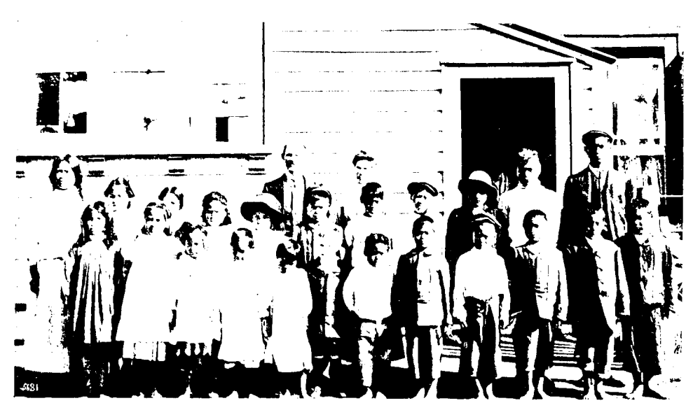
TE WHAITI NATIVE SCHOOL, UREWERA COUNTRY.