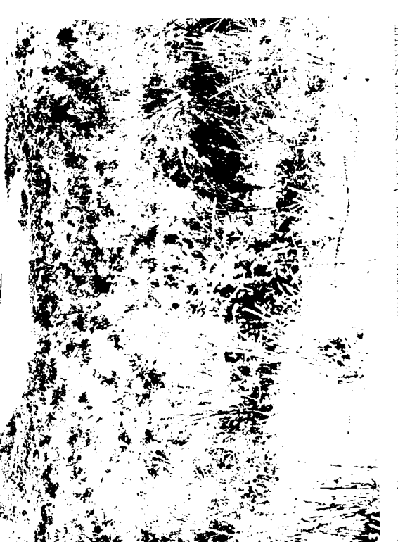
No. 12. DURE MATERIA ONED REVERTING TO THE ATIME STACE AT SUMMIT. SHRUCE IN FRONT OHERLY ("essing to phophyllot.")