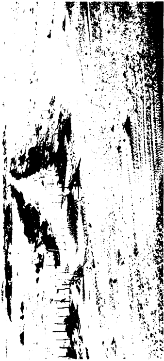
No. 2. SAND-SPIT, WAIRAKAHI BAY. IN CENTRE ARTIFICIAL FOREDUNE; NATURAL DUNES BEYOND.