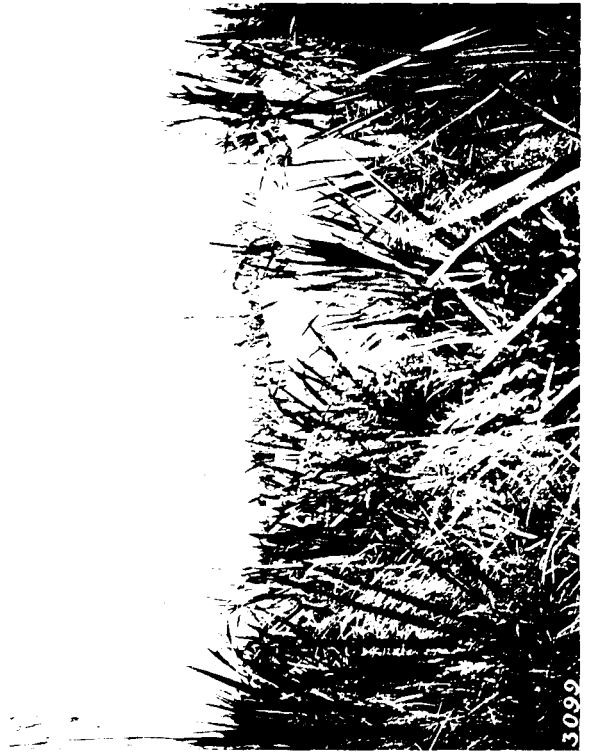
No. 4. SAND-SPIT BELONGING TO PROBING SWAMP. DUNES OF WESTERN WELLINGTON.