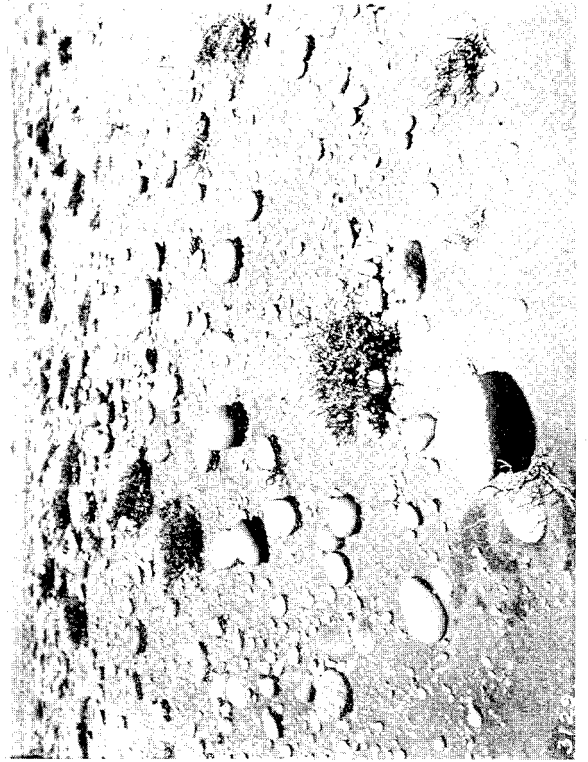
No. 35. STONY DESERT NEAR NUKUMARU, SOUTH OF RIVER WAITOTARA. THE SHRUB IS Coprosma acerosa .