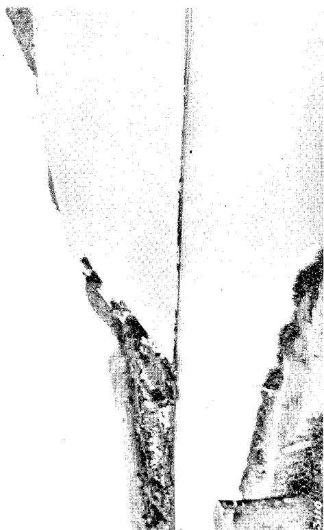
No. 17. ADVANCE OF WANDERING DUNE STOPPED BY RIVER TURAKINA. WELL-FIXED PORTION OF DUNE ABOVE.