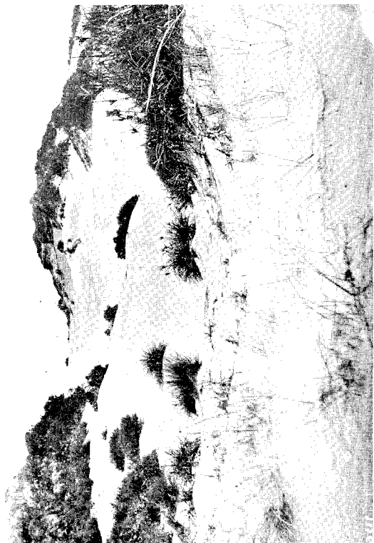
No. 18. SAND-DRIFT FROM SHORE KILLING GRASS IN DUNE-HOLLOW. IN CENTRE AND TO RIGHT Mariscus undulatus .