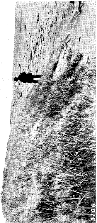
No. 13. NATURAL FOREDUNE NEAR WAIKANAE HELD BY THE SILVERY SAND-GRASS ( Spinifex hirsutus ), FORMING AN EXCELLENT PROTECTION TO THE COAST.