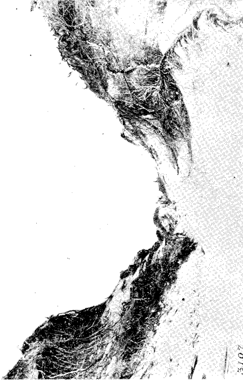
No. 14. WIND-CHANNEL BETWEEN TWO HILLS, SHOWING DESTRUCTIVE EFFECT OF MOUNDS RAISED BY SAND-BINDING PLANTS.