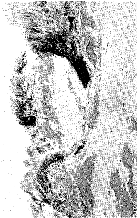
No. 15. MARRAM-GRASS PLANTED TO ARREST DRIFT HAS BUILT HILLS WHICH HAVE LED TO WIND-CHANNELS AND FRESH DESTRUCTION IN CONSEQUENCE.