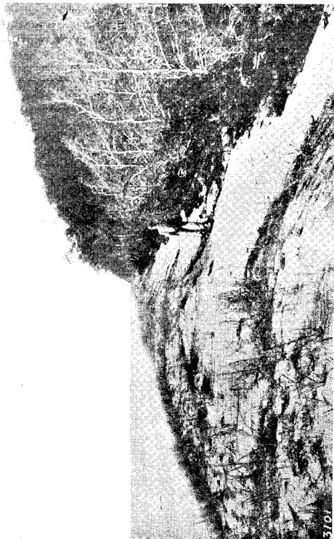
No. 7. PLANTATION OF SCOTCH-PINE ( Pinus sylvestris ), ESTABLISHED FOR MORE THAN TWENTY YEARS, JUST BEHIND ARTIFICIAL FOREDUNE ON BALTIC COAST.