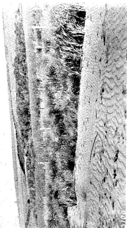
No. 6. WHEATFIELD THREATENED BY A DEEP DRIFT FROM A WANDERING DUNE, WHICH HAS PARTIALLY FILLED A SWAMP IN FRONT.