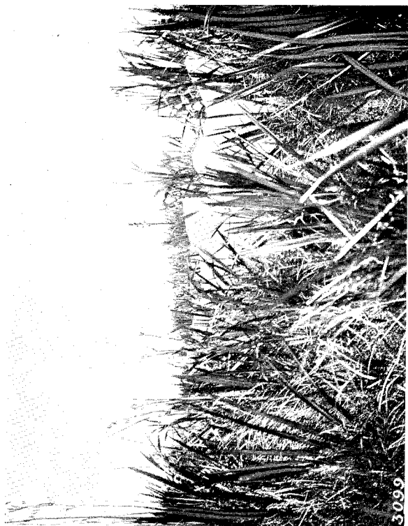
No. 5. SAND-DRIFT FILLING UP PHORMIUM SWAMP. DUNES OF WESTERN WELLINGTON.