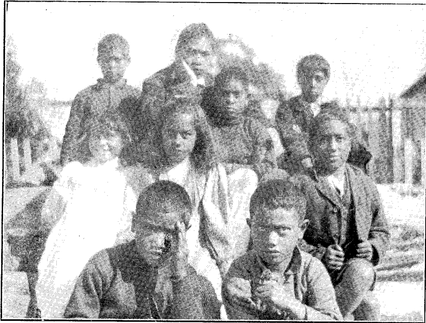
THE FIRST STANDARD CLASS, TOKOMARU BAY, EAST COAST.